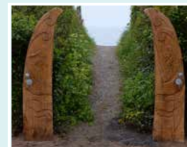
Surf / Windsurf Arch at Horton Bay Cerflun o Fwa Syrffio/Hwylfyreddio ym Mae Horton by/gan Sara Holden