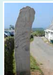
White Horse Sculpture at Rhossili Bay Cerflun Ceffyl Gwyn ym Mae Rhossili by/gan Sara Holden