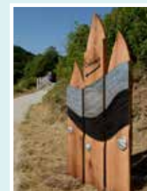
Surfboards & Fish at Caswell Bay Byrddau Syrffio a Pysgod ym Mae Caswell by/gan Ami Marsden